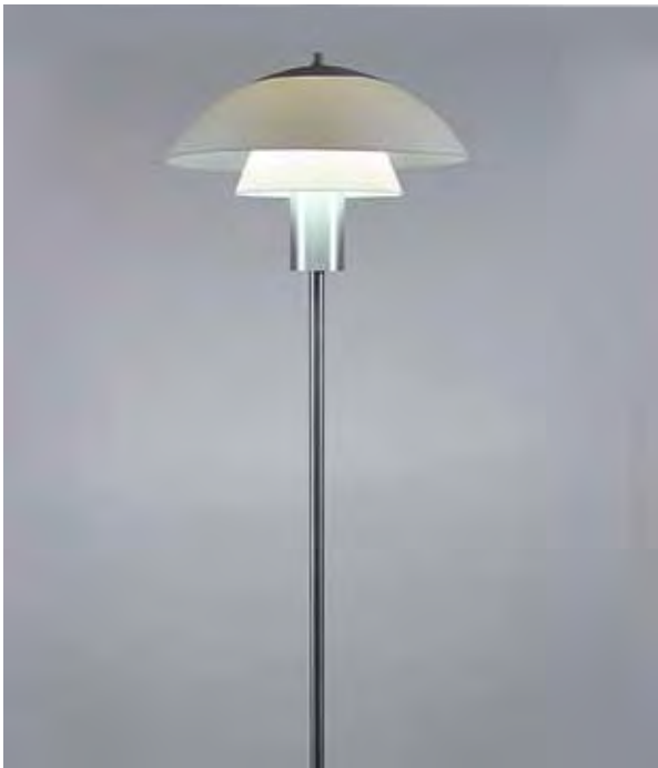
818-FL Shown in Satin Brass.