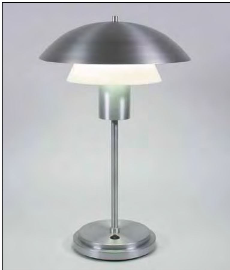
Design: Randy Borden