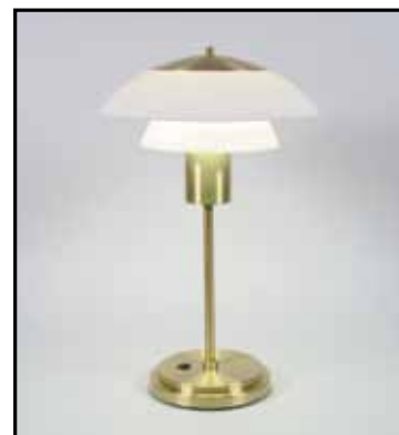
818-TL Shown with Metal Dome and Satin Aluminum Finish.