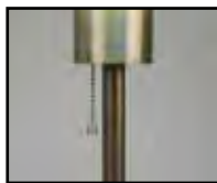
Pull chain detail.