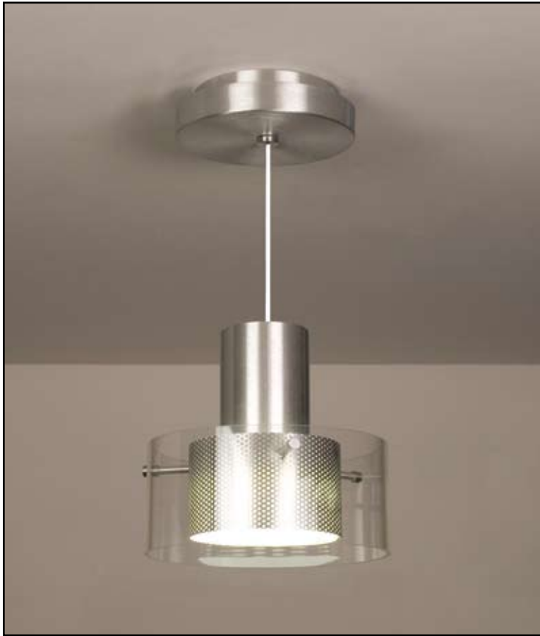
Shown with clear baffle ring.