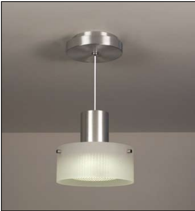
Shown with optional frosted baffle ring.