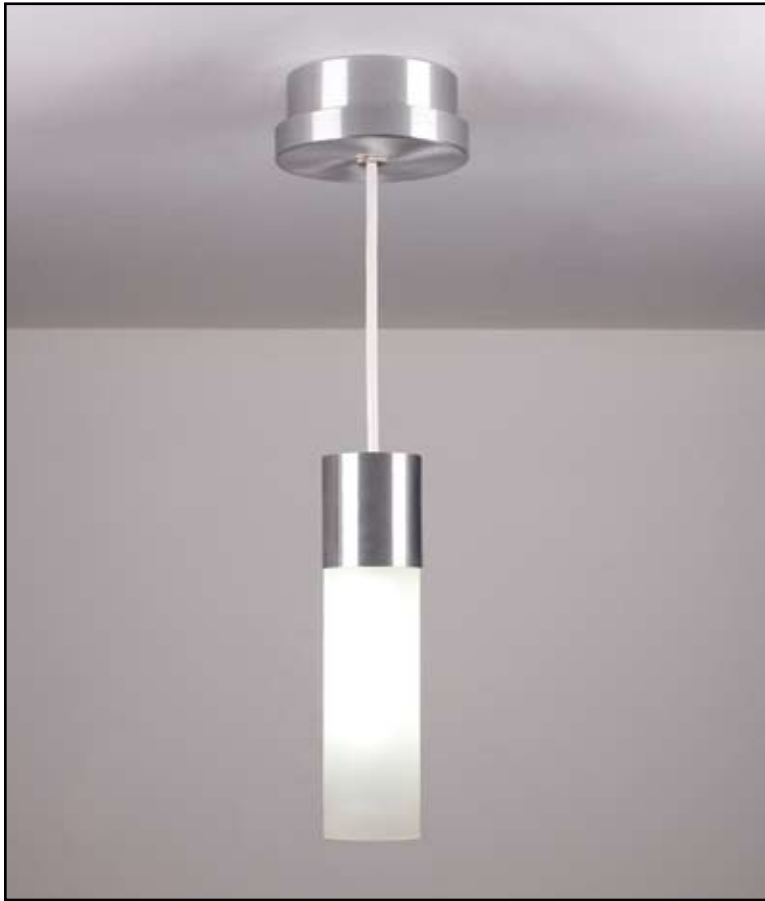
356 shown in Satin Aluminum.