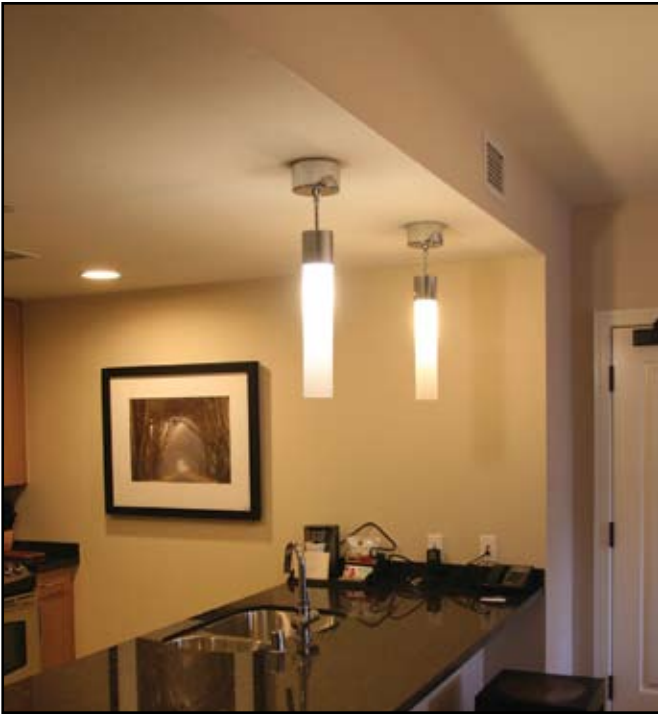
Verasa Resort Napa, CA INT DES: CHIL