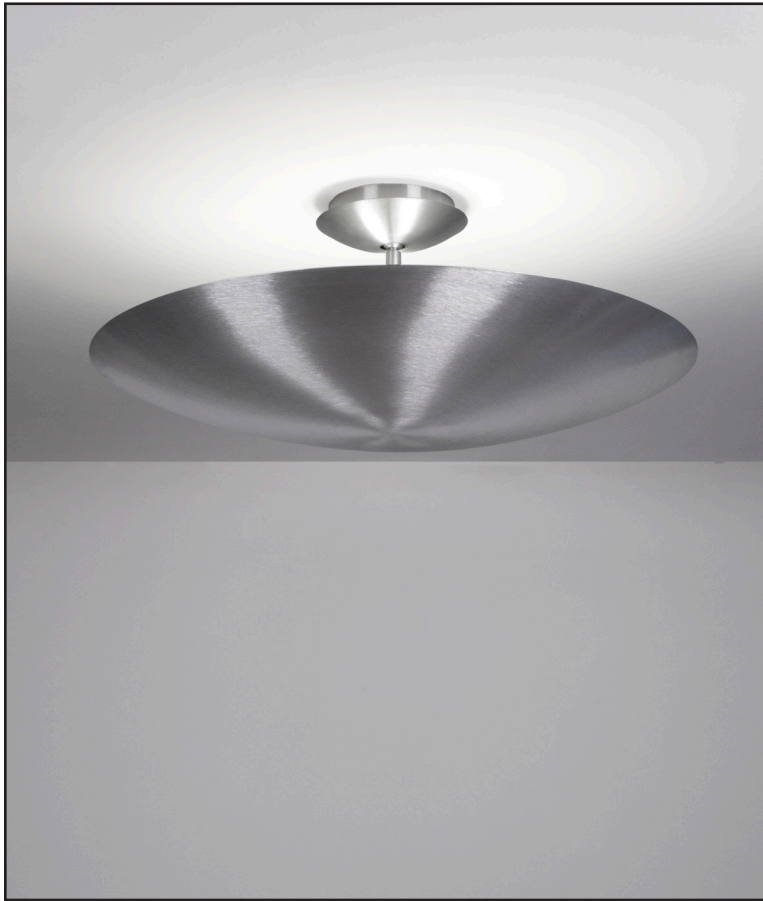
Shown in Satin Aluminum and close-to-ceiling mounting (7" OA).