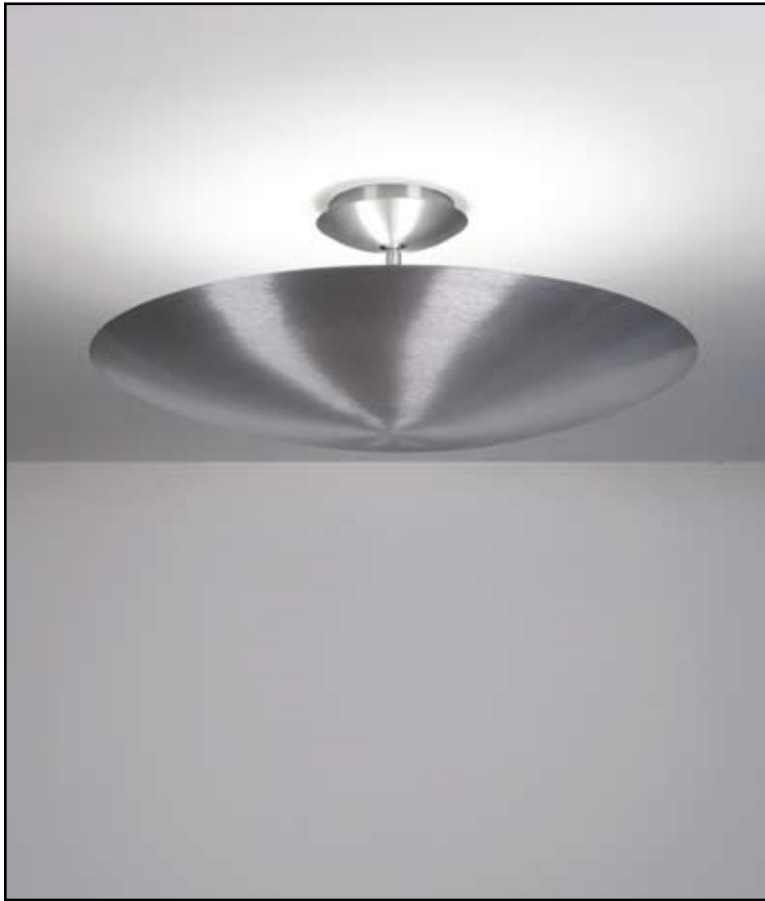
Shown in Satin Aluminum and close-to-ceiling mounting (7" OA).