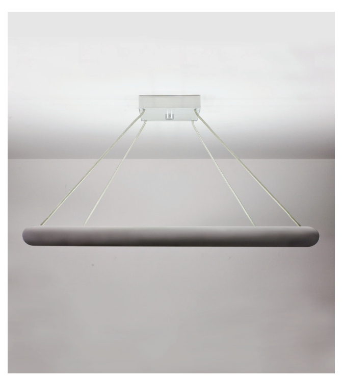
Shown in Satin Aluminum