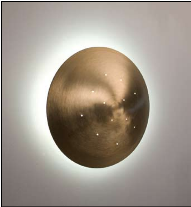
Shown in Natural Bronze with optional random perforations.