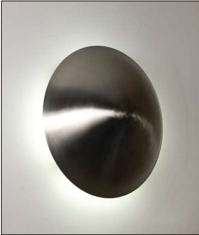
Shown in Satin Stainless Steel.