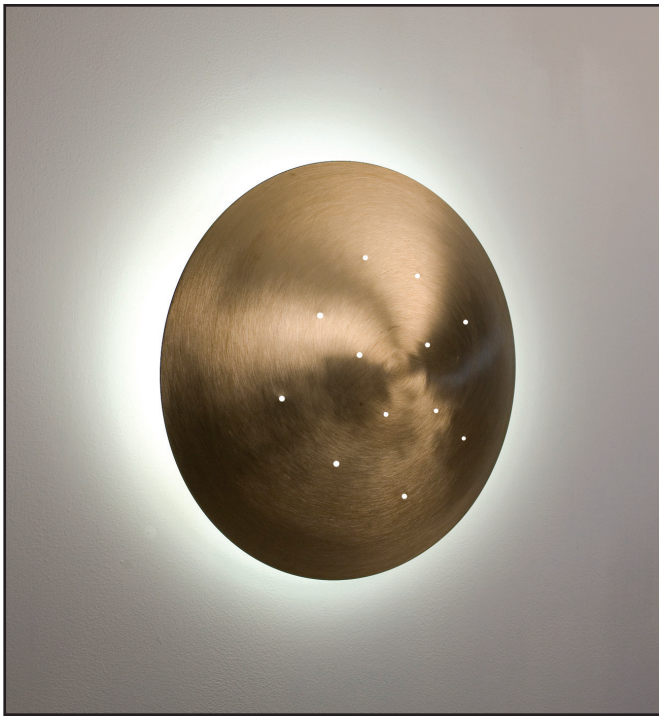
Shown in Natural Bronze with optional random perforations.