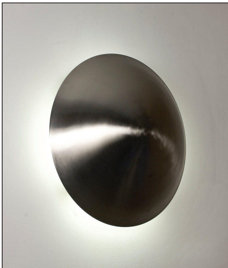
Shown in Satin Stainless Steel.