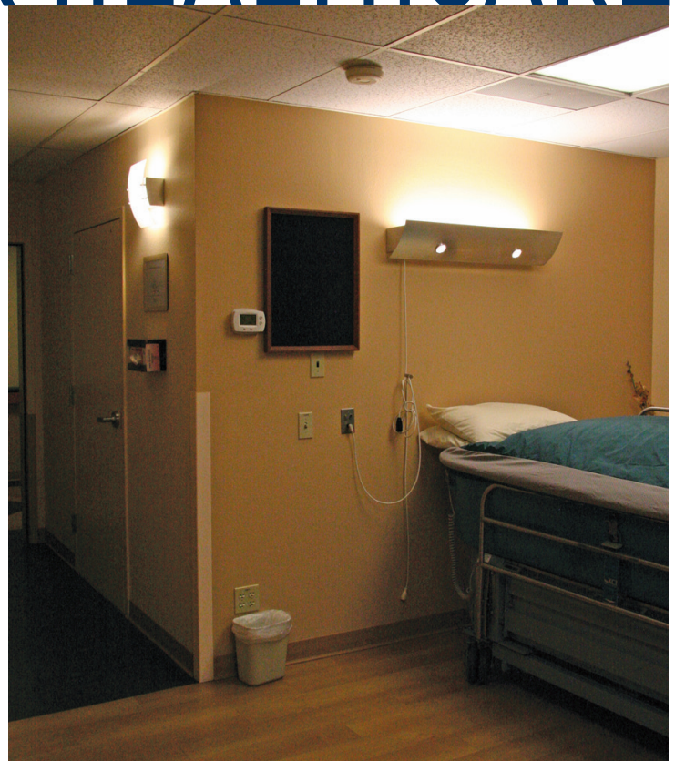
552 & M550

This nursing home renovation project involved extensive bathroom alterations and lighting and finishes upgrades. The overbed light is a modified standard product that provided increased light levels and patient control. This fixture uses T5 uplights and point source LEDs that function as reading light and for patient examination, while providing control of each function by the patient. The vanity fixture provides high light levels with low glare.