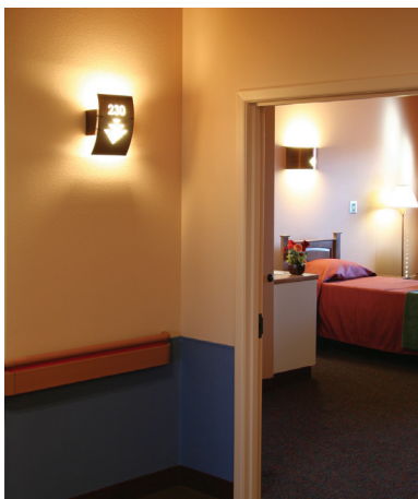
M552 & M504