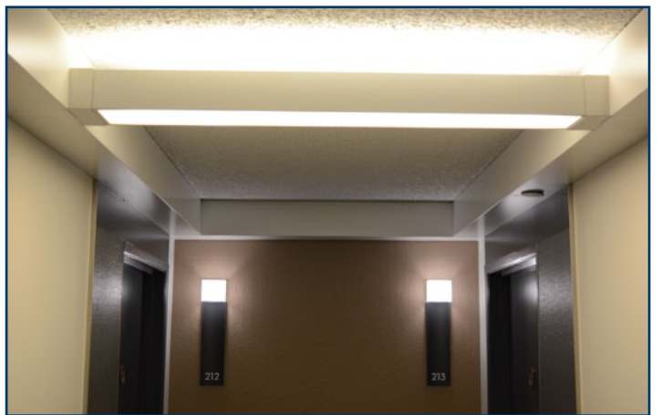
5D-2767 Fixture spans between chases for fire sprinkler piping